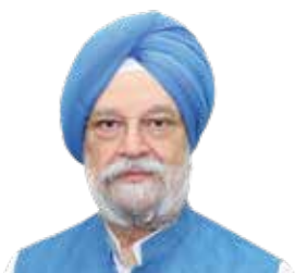
Guest of Honour

“ RERA has seen a resounding success, RERA is here to stay & has begun to show effect. ”